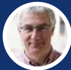
Jan Vitula Mayor of Židlochovice, Deputy Governor of the South Moravian Region and metropolitan leader

"Discussing matters at the metropolitan level? This is a completely different way of communication. It is a style of communication which provides us with space to discuss common topics."